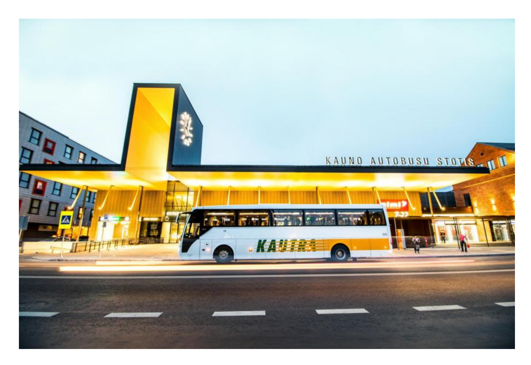
So kaunastic, right?